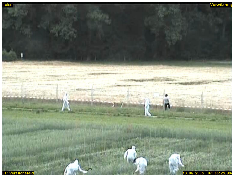
Activists destroying GMO research fields